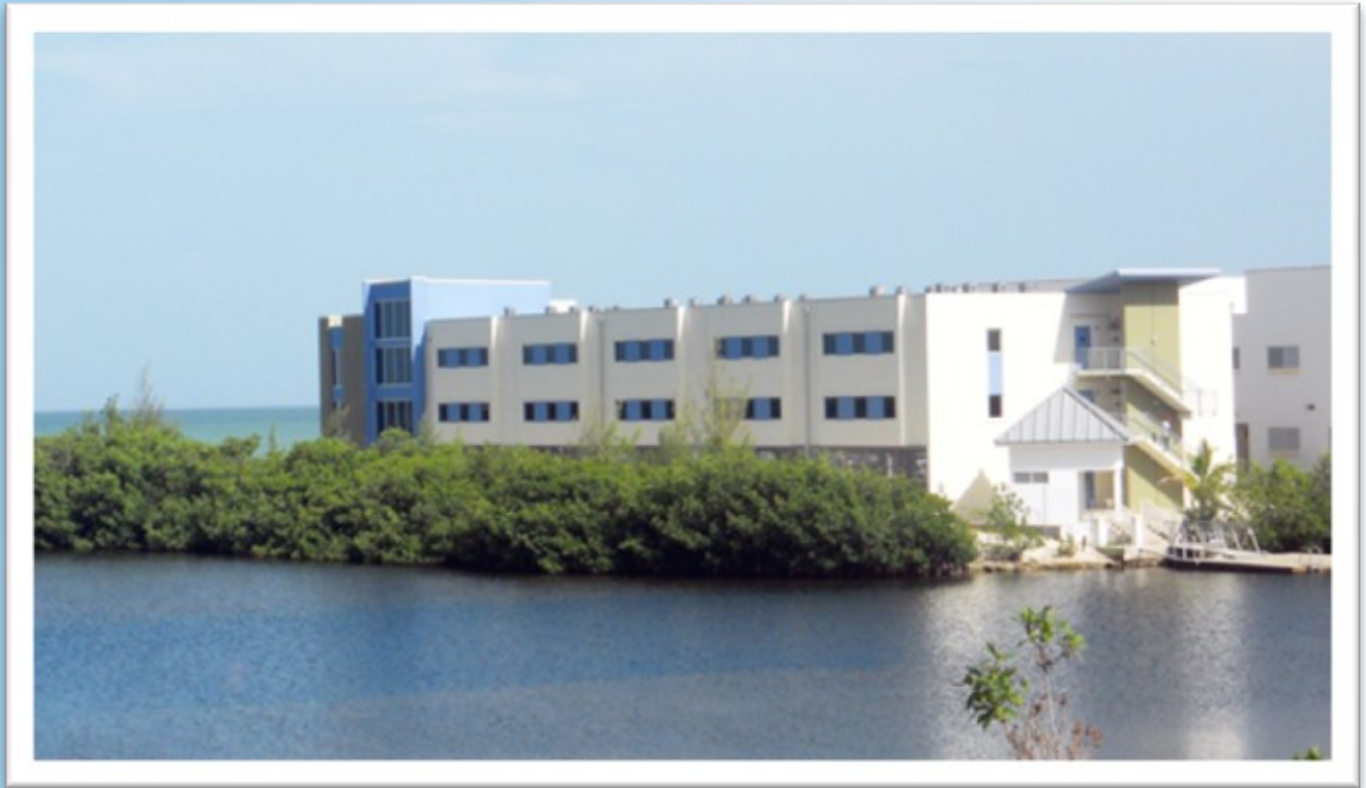
“Lagoon Landing” Student Housing, Florida Keys Community College , see pg. 2 for details